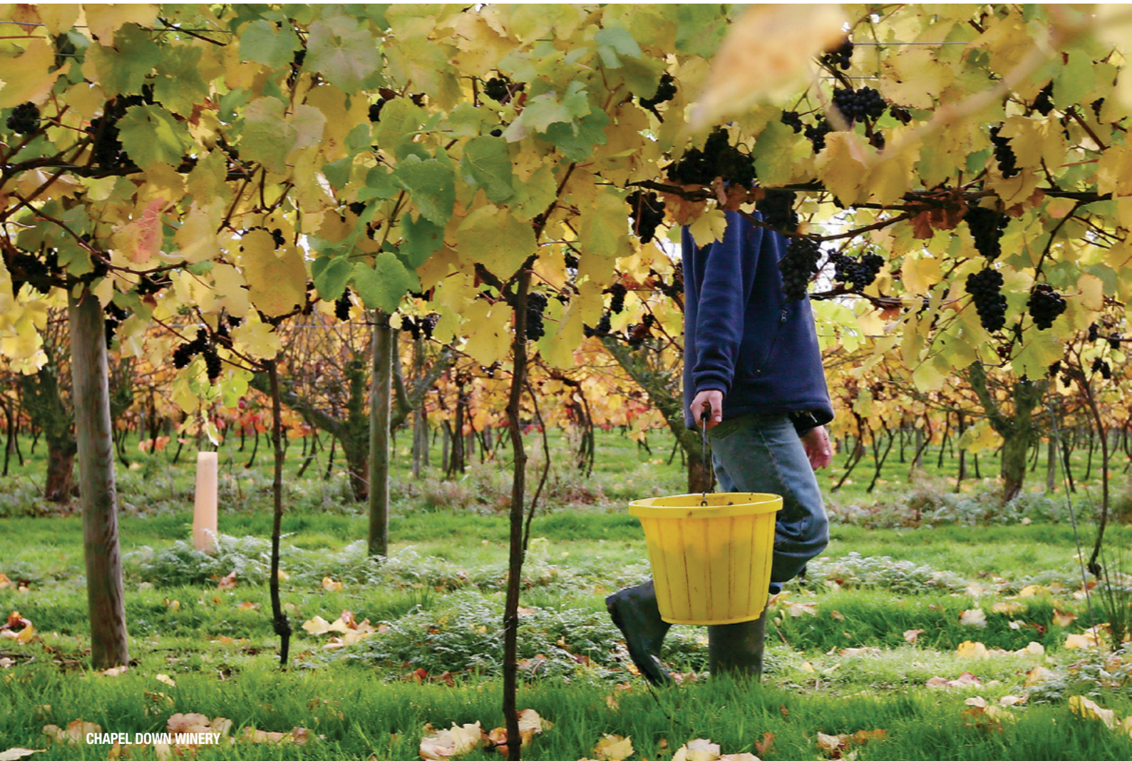
CHAPEL DOWN WINERY

In the middle of the Kent countryside, Chapel Down Winery's vineyards include a restaurant and a shop that sells local produce and wine. Go on a behind-the-scenes tour of the vineyards and learn about the intricacies of the traditional method of sparkling-wine production — the same process used to make Champagne, in which the second fermentation (how the drink gets its bubbles) takes place in the bottle.