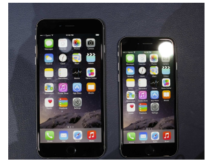
How to get a new Apple iPhone 6 for free