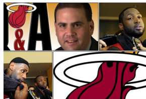
Do Heat appreciate magnitude of Game 5?